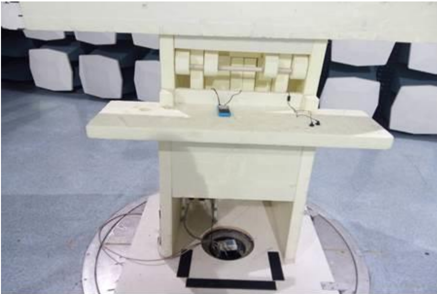
Picture 1. FCC Part 15B Radiated emissions