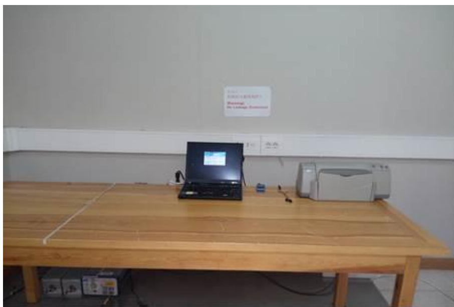
Picture 4. FCC Part 15B AC powerline conducted emissions, computer peripherals, measure from PC charger