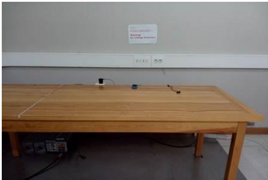
Picture 3. FCC Part 15C AC powerline conducted emissions