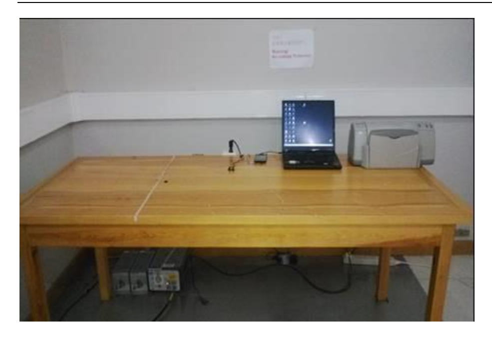
Picture 5. FCC Part 15B AC powerline conducted emissions, computer peripherals, measure from PC charger