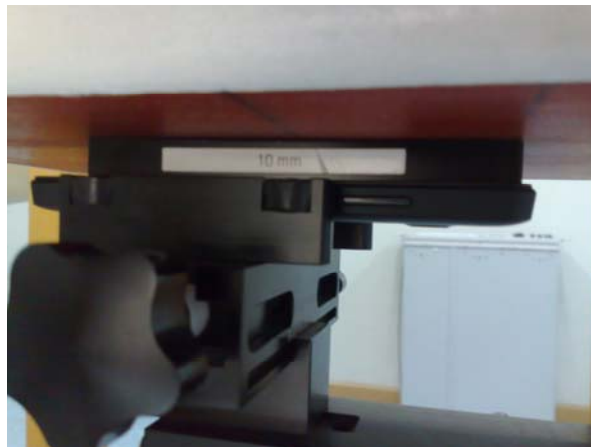
Photo of the device positioned for WR mode measurement – display facing phantom. The spacer was removed before the start of the measurements.