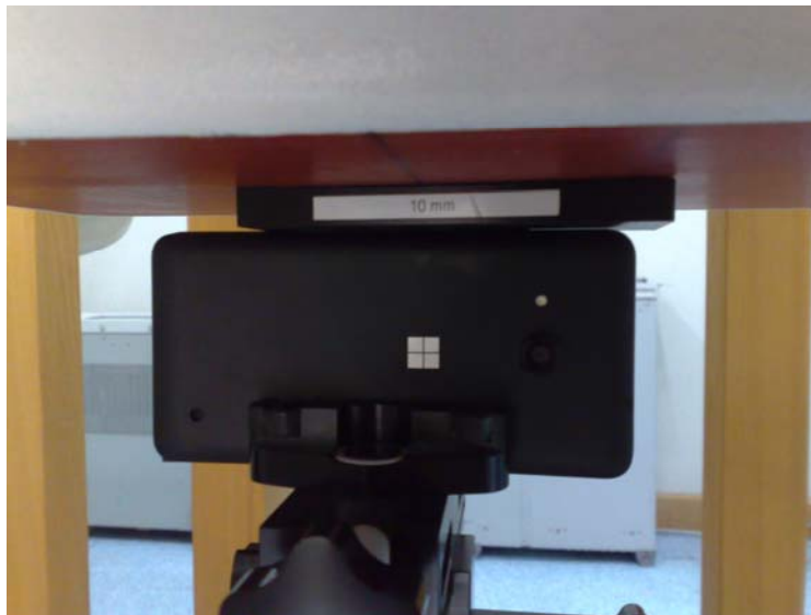
Photo of the device positioned for WR mode measurement – right edge facing phantom. The spacer was removed before the start of the measurements