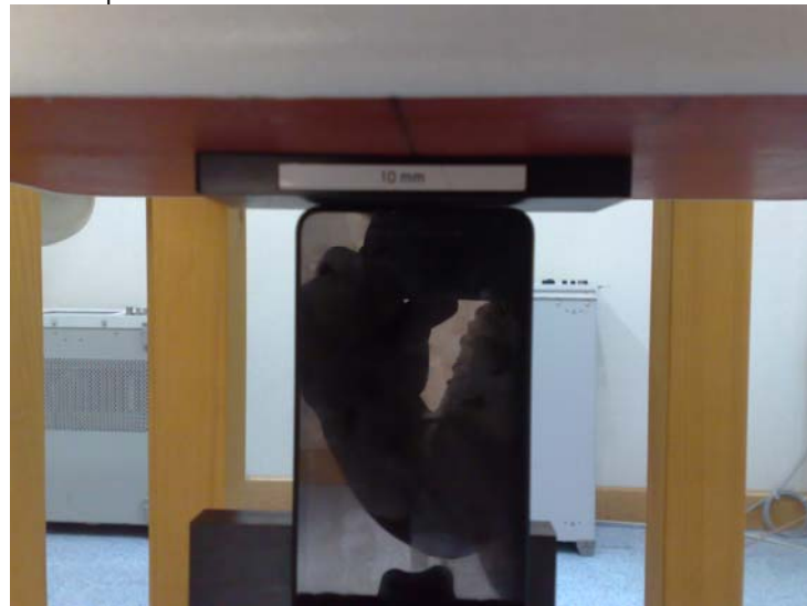
Photo of the device positioned for WR mode measurement – bottom edge facing phantom. The spacer was removed before the start of the measurements.