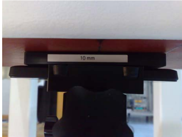
Photo of the device positioned for WR mode measurement –back facing phantom. The spacer was removed before the start of the measurements.

The device was placed in the SPEAG holder using the Microsoft spacer and, in sequence, the back, display and each of the 4 edges was positioned 10 mm away from the flat phantom. The spacer was removed before the start of the measurements.