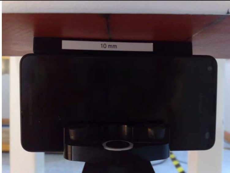
Photo of the device positioned for WR mode measurement – left edge facing phantom. The spacer was removed before the start of the measurements.