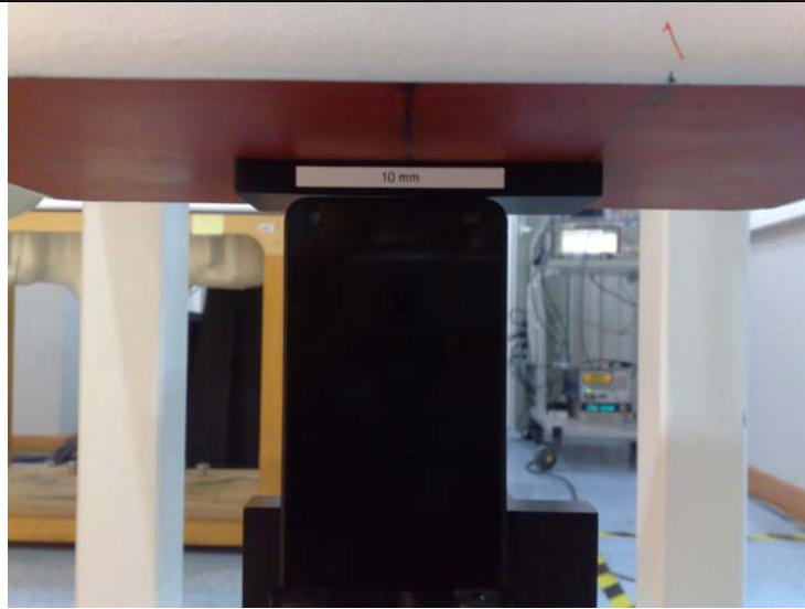
Photo of the device positioned for WR mode measurement – top edge facing phantom. The spacer was removed before the start of the measurements.