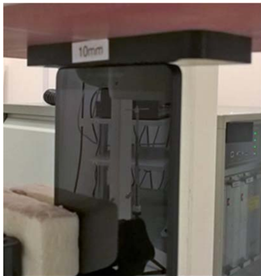
Photo of the device positioned for WR mode measurement – bottom edge facing phantom. The spacer was removed before the start of the measurements.