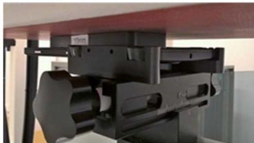
Photo of the device positioned for WR mode measurement – display facing phantom. The spacer was removed before the start of the measurements.