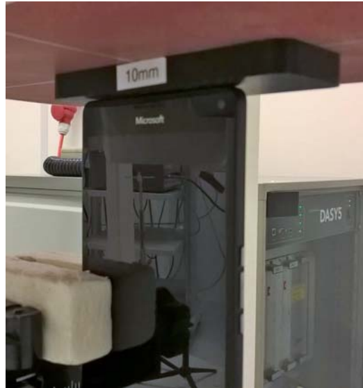
Photo of the device positioned for WR mode measurement – top edge facing phantom. The spacer was removed before the start of the measurements.