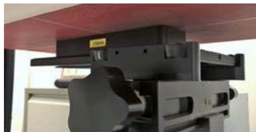
Photo of the device positioned for Body SAR measurement. The spacer was removed for the tests.

The device was placed in the SPEAG holder using the Microsoft spacer and placed below the flat phantom. The distance between the device and the phantom was kept at the separation distance indicated in the photo below using a separate flat spacer that was removed before the start of the measurements. The device was oriented with both sides facing the phantom to find the highest results.