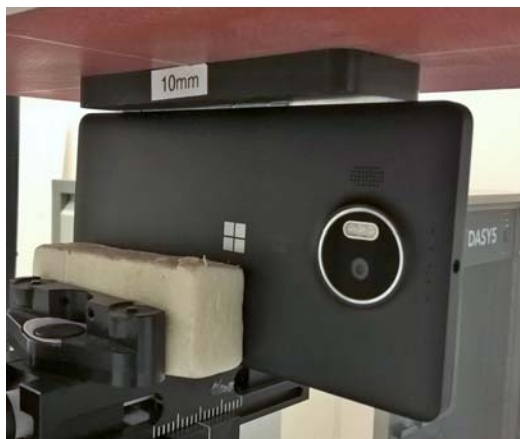
Photo of the device positioned for WR mode measurement – right edge facing phantom. The spacer was removed before the start of the measurements