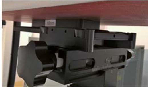
Photo of the device positioned for WR mode measurement –back facing phantom. The spacer was removed before the start of the measurements.

The device was placed in the SPEAG holder using the Microsoft spacer and, in sequence, the back, display and each of the 4 edges was positioned 10 mm away from the flat phantom. The spacer was removed before the start of the measurements.