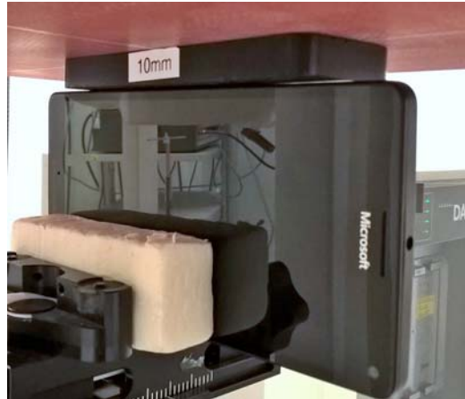
Photo of the device positioned for WR mode measurement – left edge facing phantom. The spacer was removed before the start of the measurements.