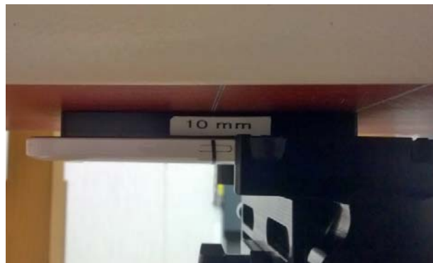
Photo of the device positioned for WR mode measurement – display facing phantom. The spacer was removed before the start of the measurements.