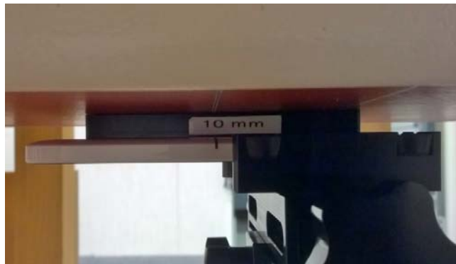
Photo of the device positioned for WR mode measurement –back facing phantom. The spacer was removed before the start of the measurements.

The device was placed in the SPEAG holder using the Microsoft spacer and, in sequence, the back, display and each of the 4 edges was positioned 10 mm away from the flat phantom. The spacer was removed before the start of the measurements.