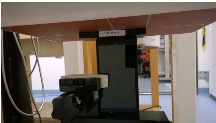
Photo of the device positioned for WR mode measurement – bottom edge facing phantom. The spacer was removed before the start of the measurements.