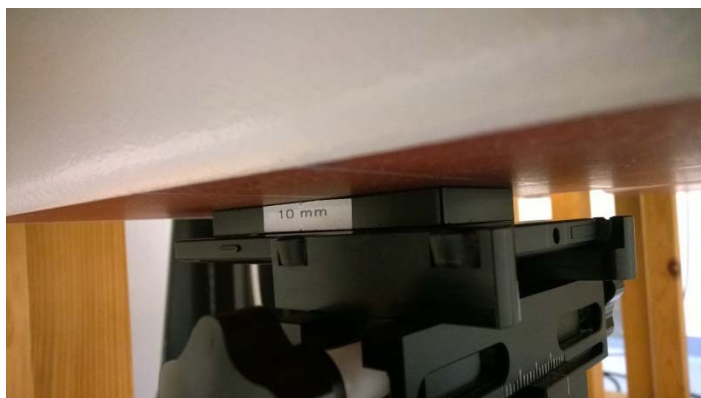
Photo of the device positioned for WR mode measurement – display facing phantom. The spacer was removed before the start of the measurements.