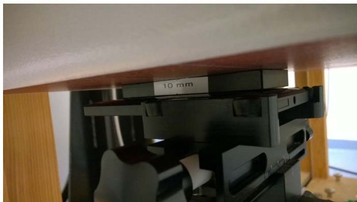
Photo of the device positioned for WR mode measurement –back facing phantom. The spacer was removed before the start of the measurements.

The device was placed in the SPEAG holder using the Nokia spacer and, in sequence, the back, display and each of the 4 edges was positioned 10.0mm away from the flat phantom. The spacer was removed before the start of the measurements.