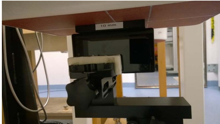
Photo of the device positioned for WR mode measurement – left edge facing phantom. The spacer was removed before the start of the measurements.