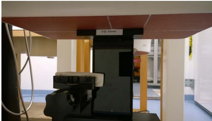
Photo of the device positioned for WR mode measurement – top edge facing phantom. The spacer was removed before the start of the measurements.