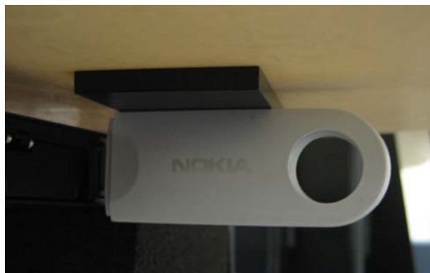
Device directly connected to a vertical USB port of the Lenovo laptop computer, side 4 facing the phantom. The 0.5 cm spacer was removed before the test.