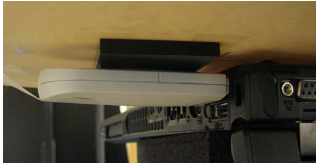
Device directly connected to a horizontal USB port of the IBM laptop computer, side 1 facing the phantom. The 0.5 cm spacer was removed before the test.

directly connected to a horizontal or to a vertical USB port of the laptop computer positioned against the phantom, and the other two orientations were tested with the device connected to the laptop computer using the high quality USB cable assembly CA-175D.