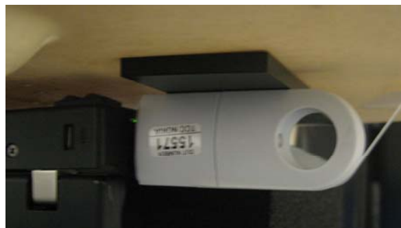
Device directly connected to a vertical USB port of the Lenovo laptop computer, side 3 facing the phantom. The 0.5 cm spacer was removed before the test.