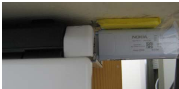
Device directly connected to a vertical USB port of the Amilo laptop computer, side 4 facing the phantom. The 0.5 cm spacer was removed before the test.