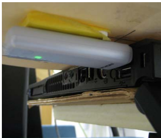
Device directly connected to a horizontal USB port of the IBM laptop computer, side 1 facing the phantom. The 0.5 cm spacer was removed before the test.

The device was placed below the flat section of the phantom. The distance between the device and the phantom was kept at the separation distance of 0.5 cm using a flat spacer that was removed before starting the measurements. The device was oriented with all five sides facing the phantom to find the highest result. Two of the orientations were tested with device directly connected to a horizontal or to a vertical USB port of the laptop computer positioned against the phantom, and the other three orientations were tested with the device connected to the laptop computer using the high quality USB cable assembly CA-175D.