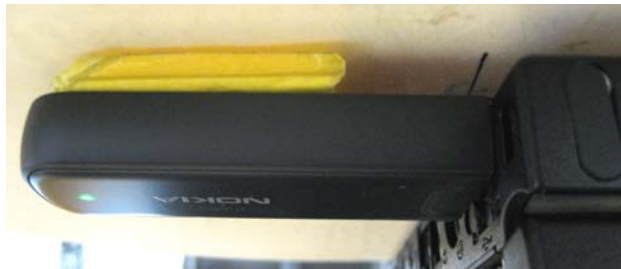
Device directly connected to a horizontal USP port of the IBM laptop computer, side 1 facing the phantom. The 0.5 cm spacer was removed before the test.

The device was placed below the flat section of the phantom. The distance between the device and the phantom was kept at the separation distance of 0.5 cm using a flat spacer that was removed before starting the measurements. The device was oriented with all five sides facing the phantom to find the highest result. Two of the orientations were tested with device directly connected to a horizontal or to a vertical USB port of the laptop computer positioned against the phantom, and the other three orientations were tested with the device connected to the laptop computer using a high quality USB cable.