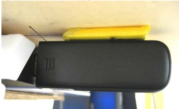
Device directly connected to a vertical USP port of the Amilo laptop computer, side 4 facing the phantom. The 0.5 cm spacer was removed before the test.