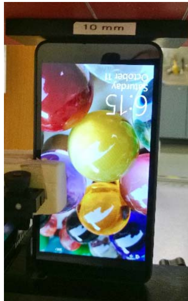
Photo of the device positioned for WR mode measurement – bottom edge facing phantom. The spacer was removed before the start of the measurements.