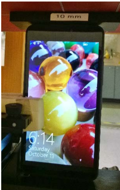
Photo of the device positioned for WR mode measurement – top edge facing phantom. The spacer was removed before the start of the measurements.