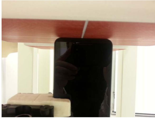
Photo of the device positioned for Extremity measurement – bottom edge facing phantom with 0cm separation distance.