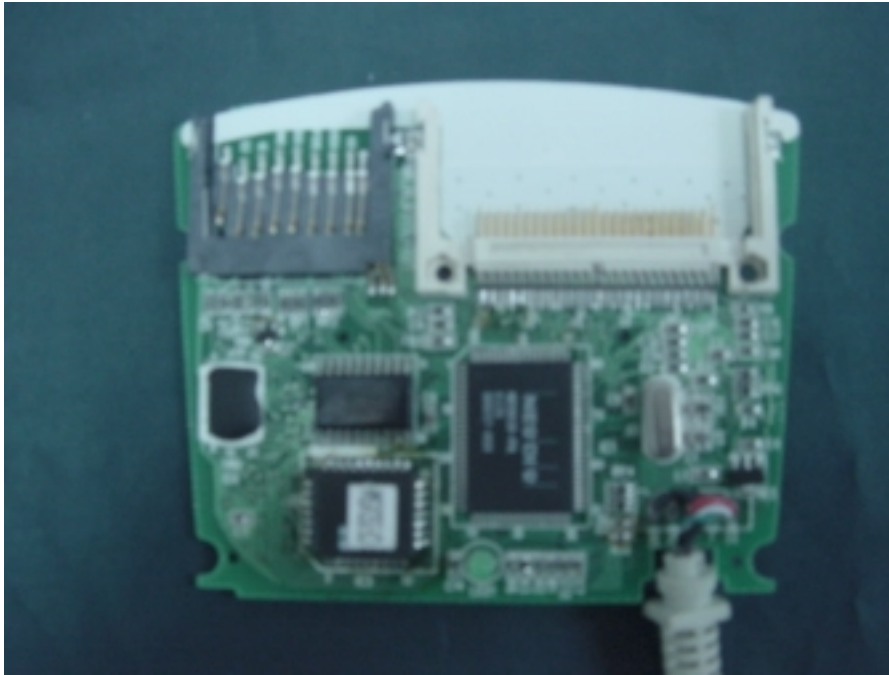
Appearance of PCB Board(Card Reader)