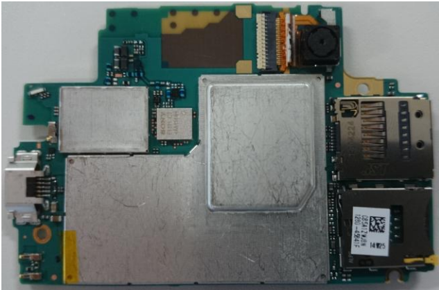
Internal PWB with Shield cases (Front-side)