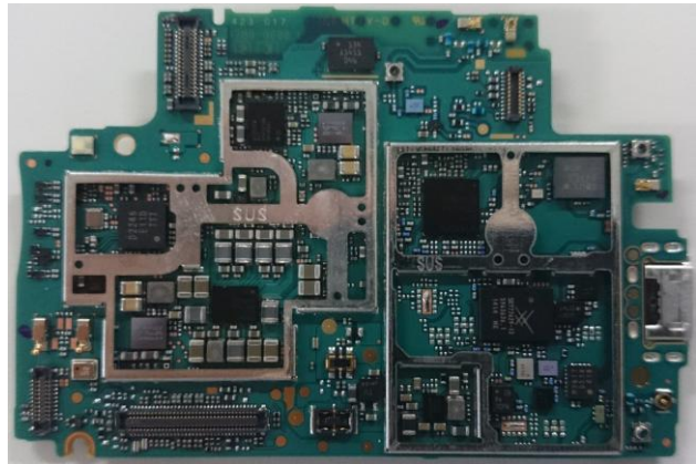
Internal PWB without Shield cases (Rear-side)