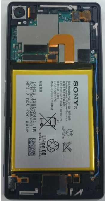
Without Rear Panel