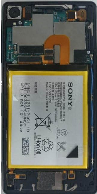
Without Rear Panel