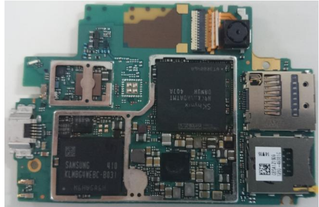
Internal PWB without Shield cases (Front-side)