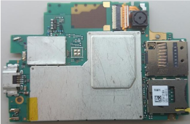
Internal PWB with Shield cases (Front-side)