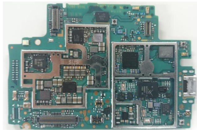
Internal PWB without Shield cases (Rear-side)