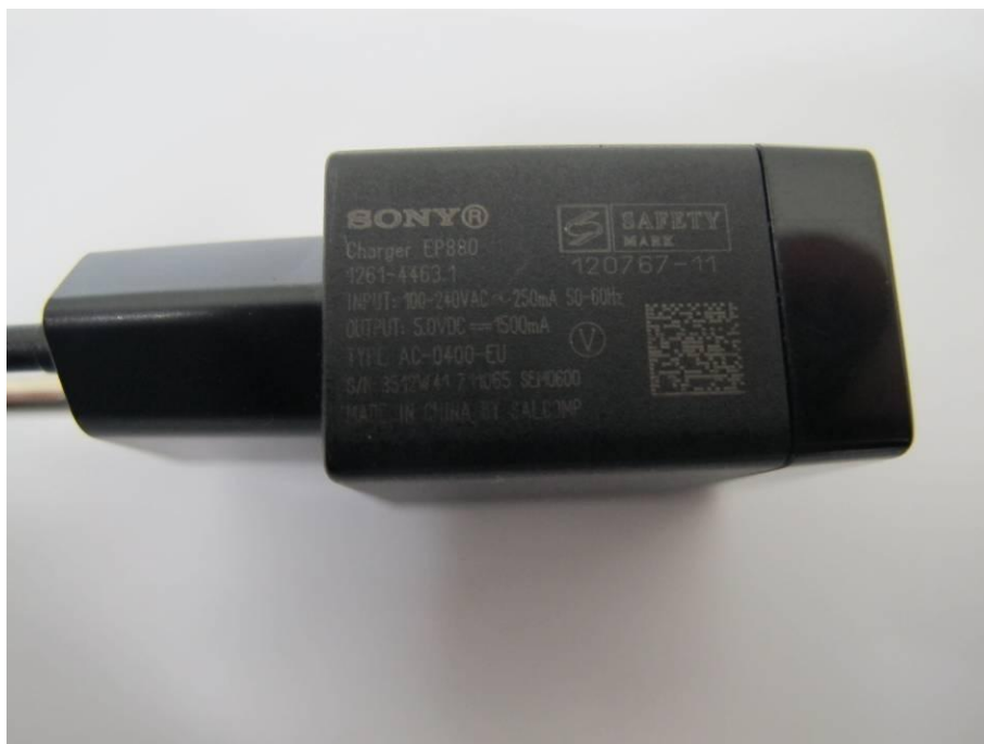
Label of Travel Charger