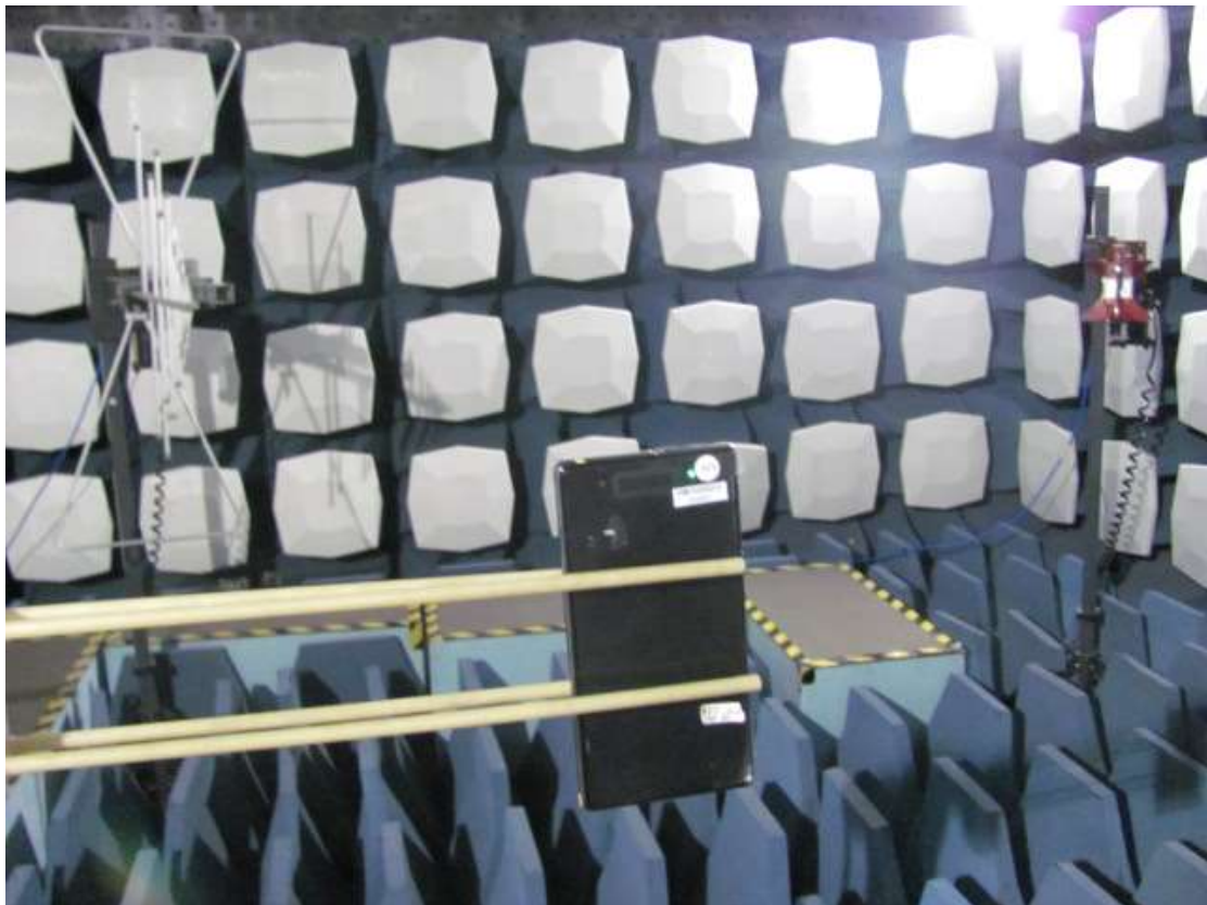
Radiated spurious emission