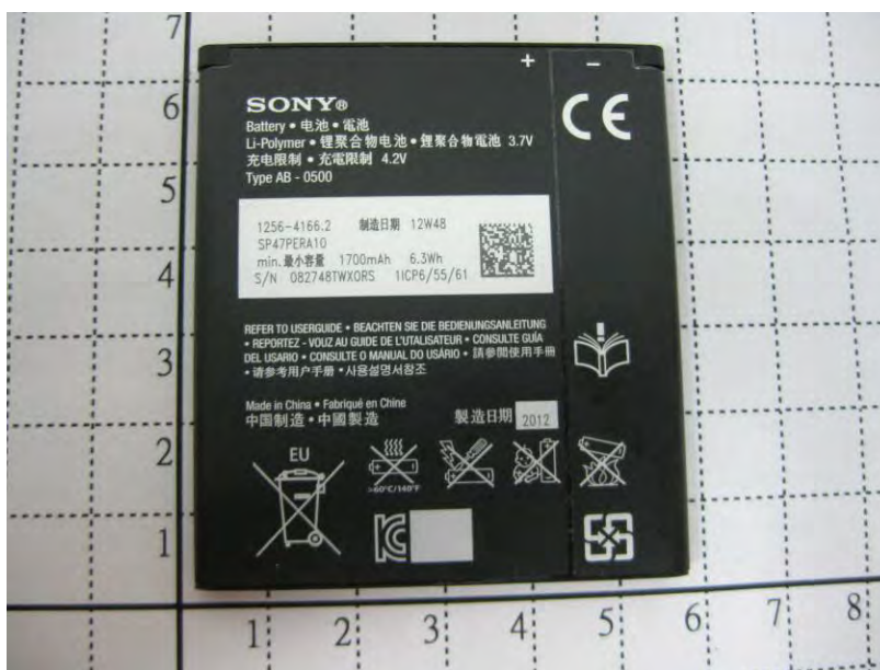
Fig.6 Back view of battery (Model No.: BA900, Supplier: SONY, Type No.: AB-0500)