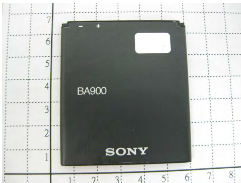
Fig.5 Front view of battery (Model No.: BA900, Supplier: SONY, Type No.: AB-0500)