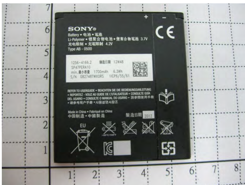
Fig.6 Back view of battery (Model No.: BA900, Supplier: SONY, Type No.: AB-0500)