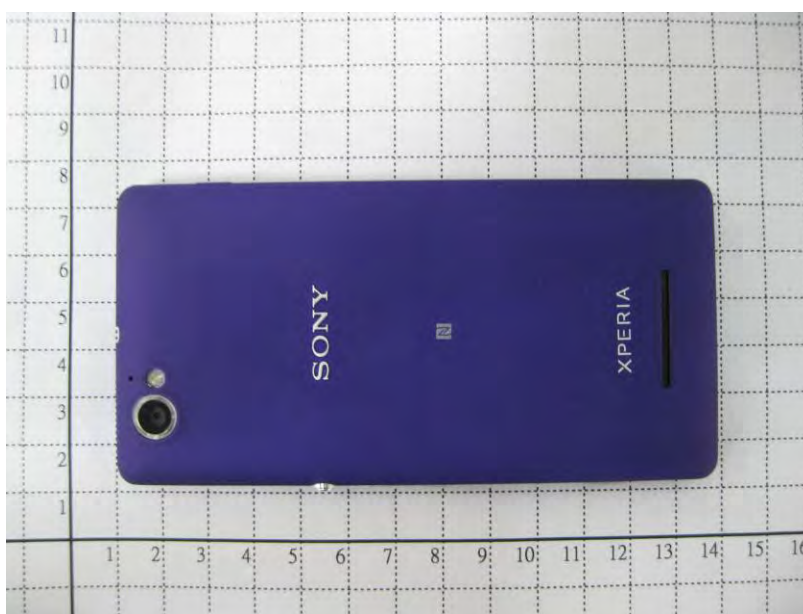
Fig. 4 Back view of EUT

Unless otherwise stated the results shown in this test report refer only to the sample(s) tested and such sample(s) are retained for 90 days only.