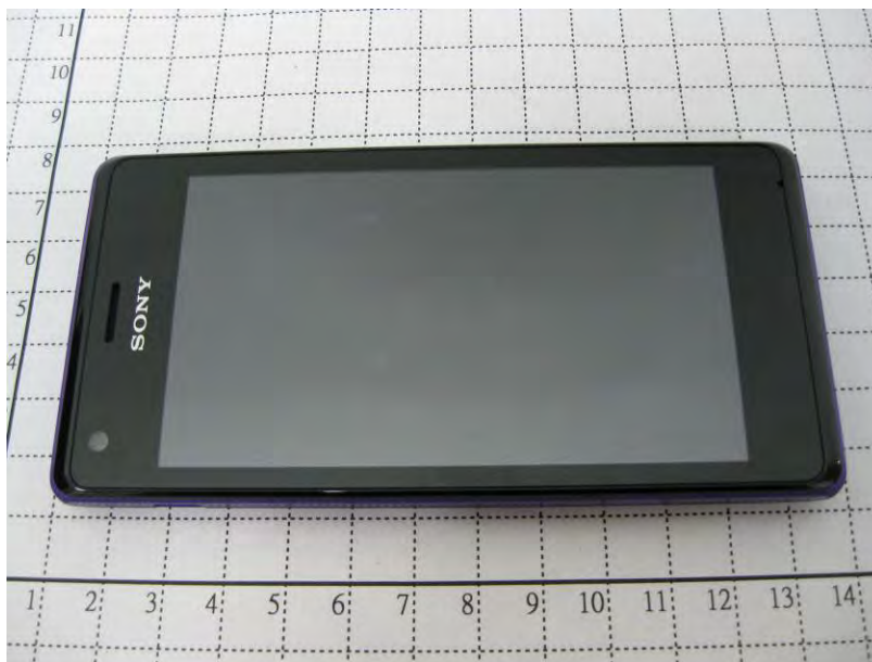
Fig. 3 Front view of EUT