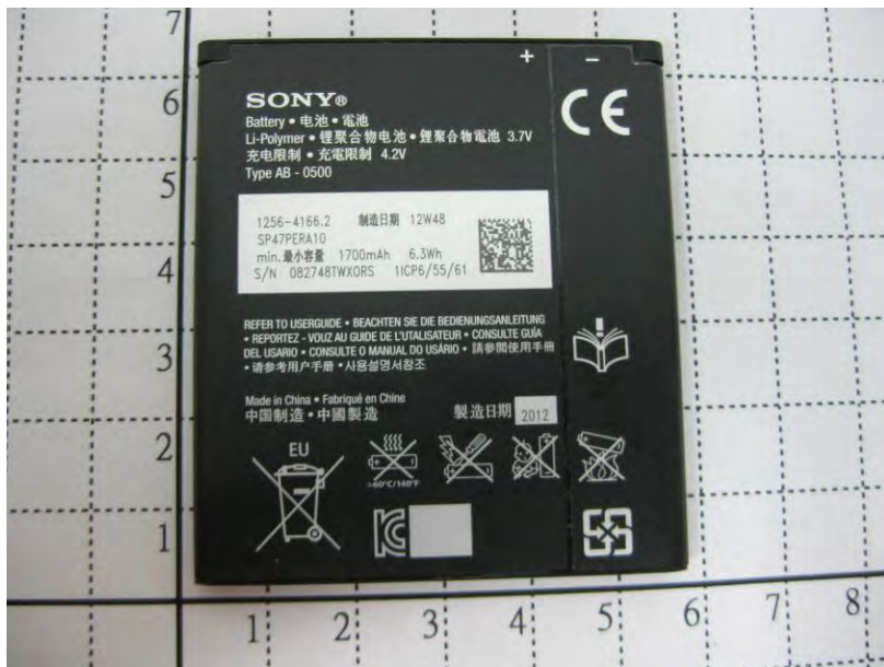
Fig.6 Back view of battery (Model No.: BA900, Supplier: SONY, Type No.: AB-0500)