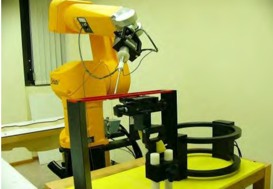
Fig.1 Photograph of the DASY 5 measurement system