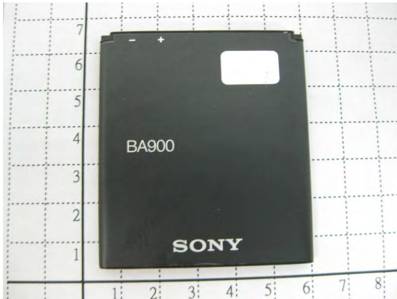
Fig.5 Front view of battery (Model No.: BA900, Supplier: SONY, Type No.: AB-0500)