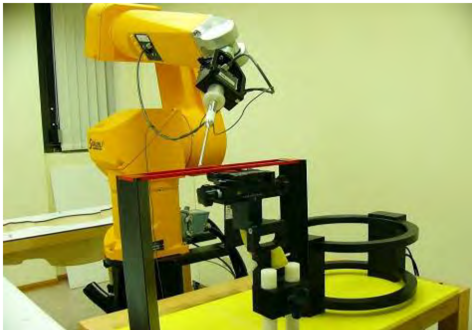
Fig. 1 Photograph of the DASY 5 measurement system