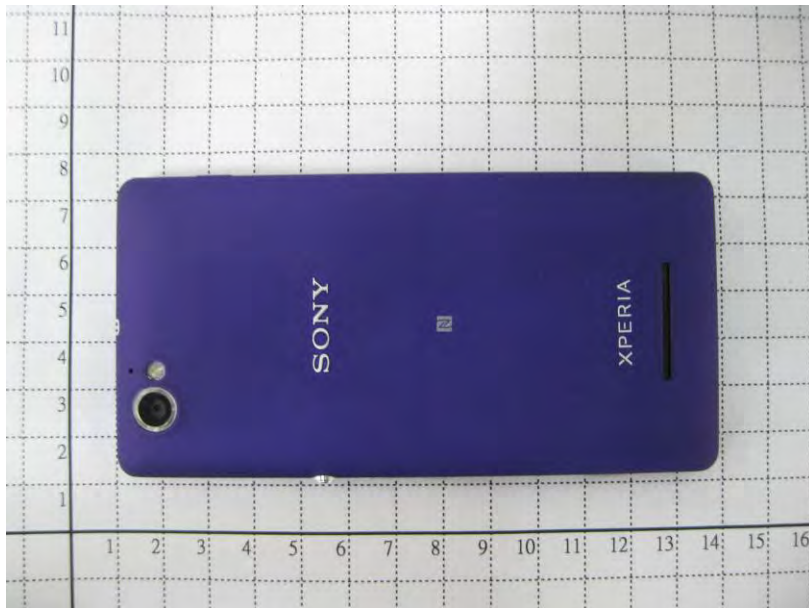
Fig. 4 Back view of EUT

Unless otherwise stated the results shown in this test report refer only to the sample(s) tested and such sample(s) are retained for 90 days only.