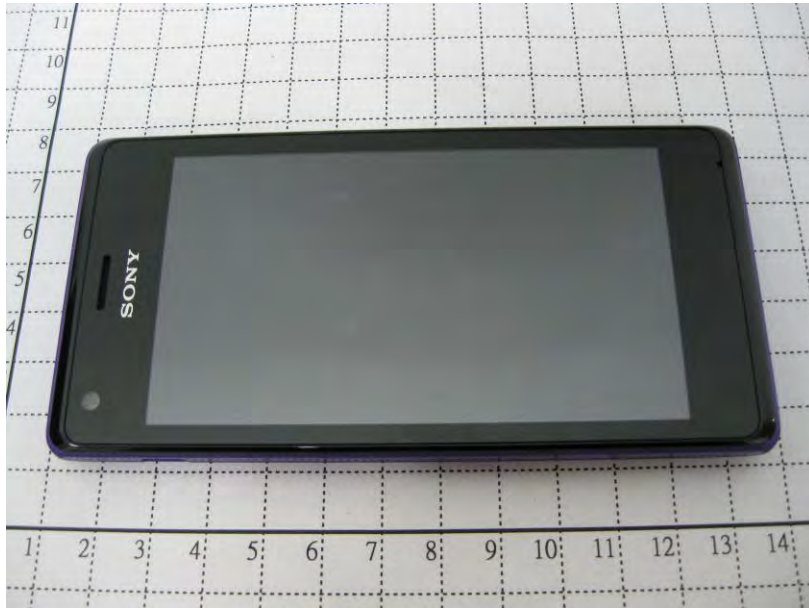
Fig. 3 Front view of EUT