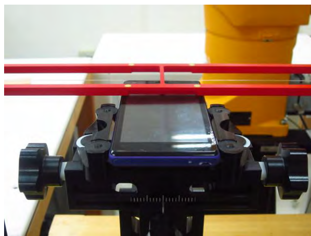
Fig. 2 Receiver of mobile contact center of Arch

Unless otherwise stated the results shown in this test report refer only to the sample(s) tested and such sample(s) are retained for 90 days only.