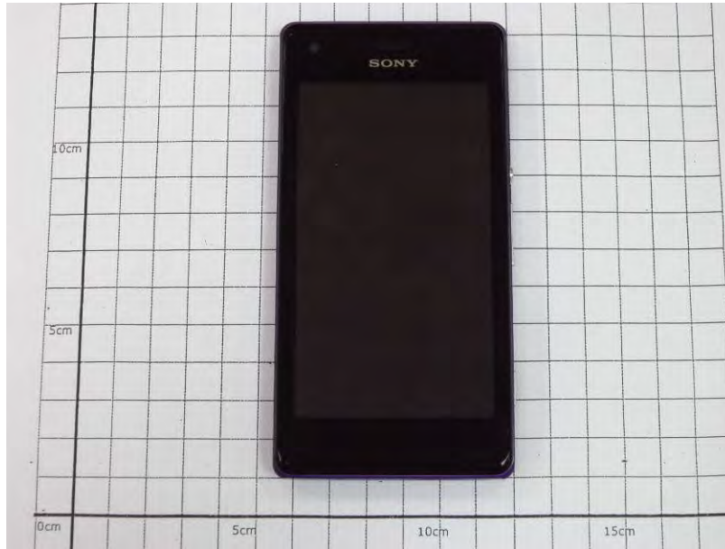
Fig. 3 Front view of EUT