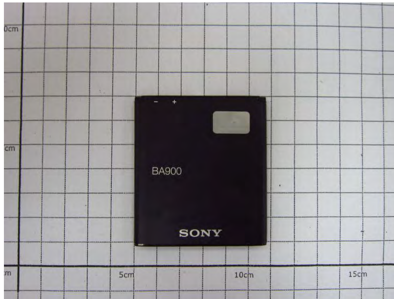
Fig.5 Front view of battery (Model No.: BA900, Supplier: SONY, Type No.: AB-0500)