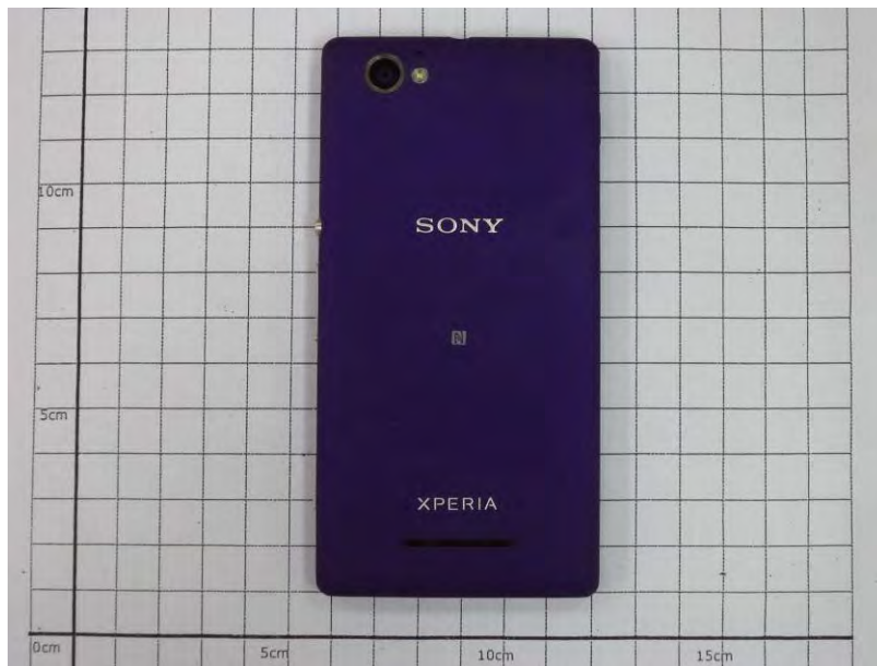
Fig. 4 Back view of EUT

Unless otherwise stated the results shown in this test report refer only to the sample(s) tested and such sample(s) are retained for 90 days only.