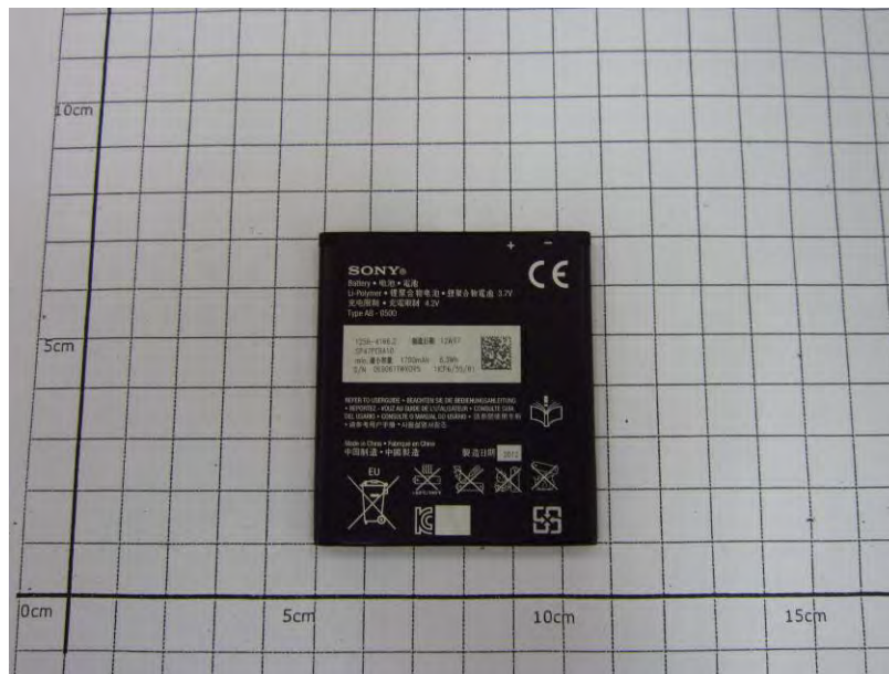
Fig.6 Back view of battery (Model No.: BA900, Supplier: SONY, Type No.: AB-0500)