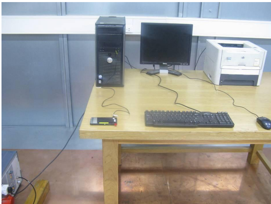
Pic.2 Conducted emission