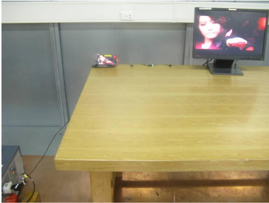
Pic.2 Conducted emission