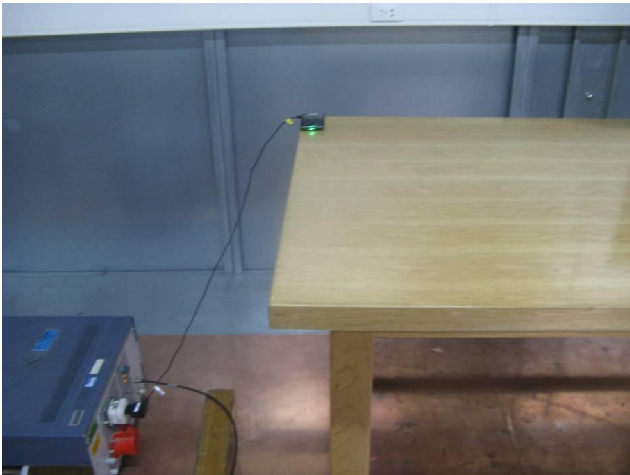
Pic.2 Conducted emission