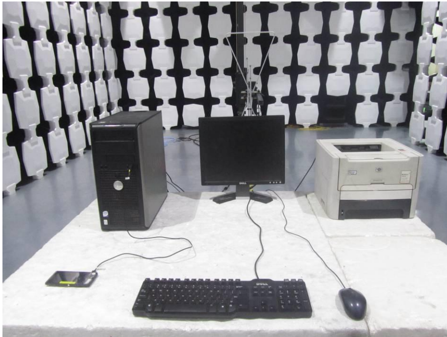
Pic.1 Radiated emission