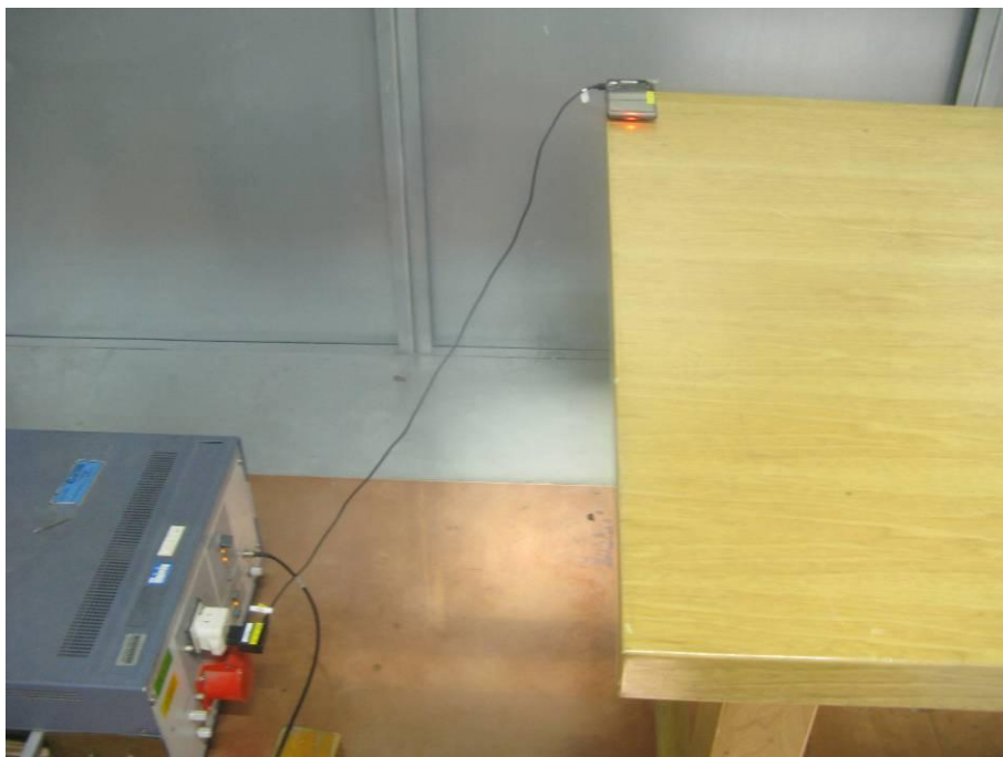
Pic.2 Conducted emission