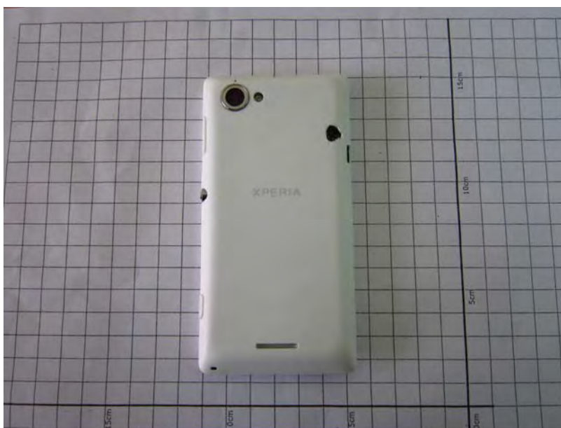
Fig. 4 Back view of EUT

Unless otherwise stated the results shown in this test report refer only to the sample(s) tested and such sample(s) are retained for 90 days only.