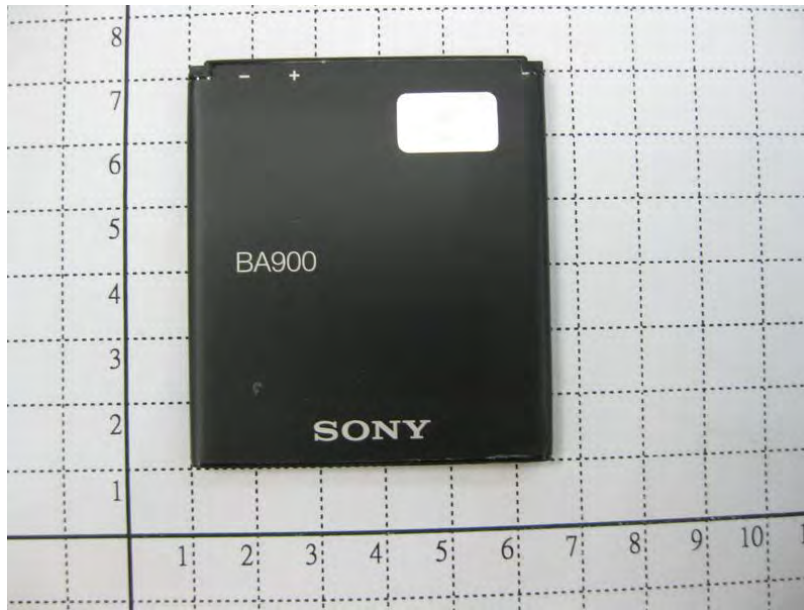
Fig.5 Front view of battery (Model No.: BA900, Supplier: SONY, Type No.: AB-0500)