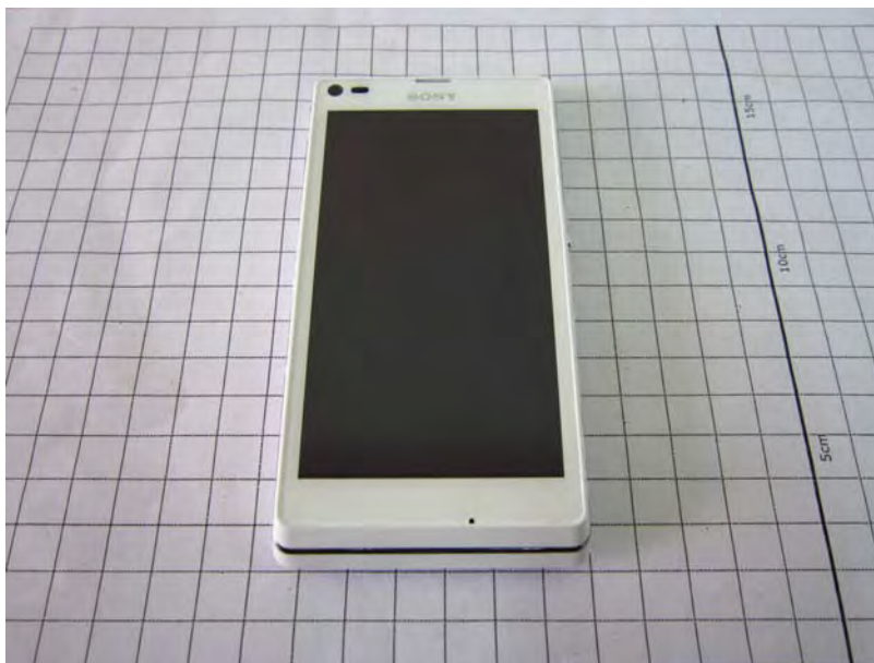
Fig. 3 Front view of EUT