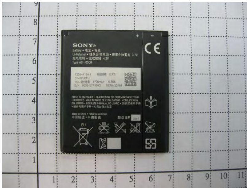
Fig.6 Back view of battery (Model No.: BA900, Supplier: SONY, Type No.: AB-0500)