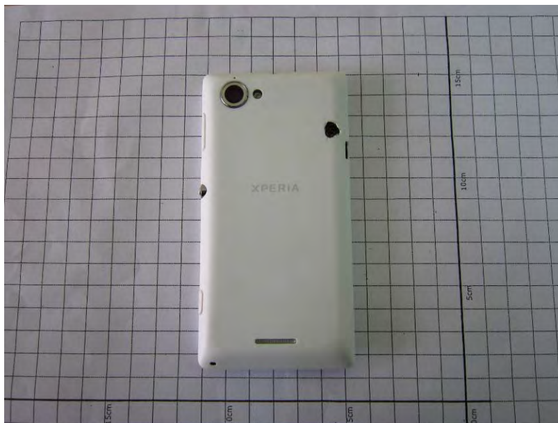
Fig. 4 Back view of EUT

Unless otherwise stated the results shown in this test report refer only to the sample(s) tested and such sample(s) are retained for 90 days only.