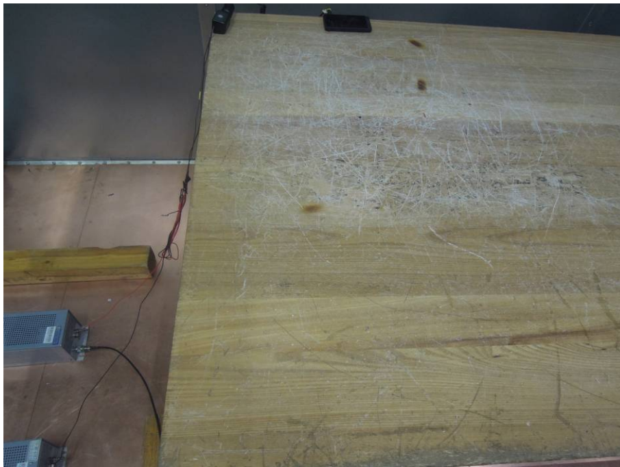
Pic.2 Conducted emission