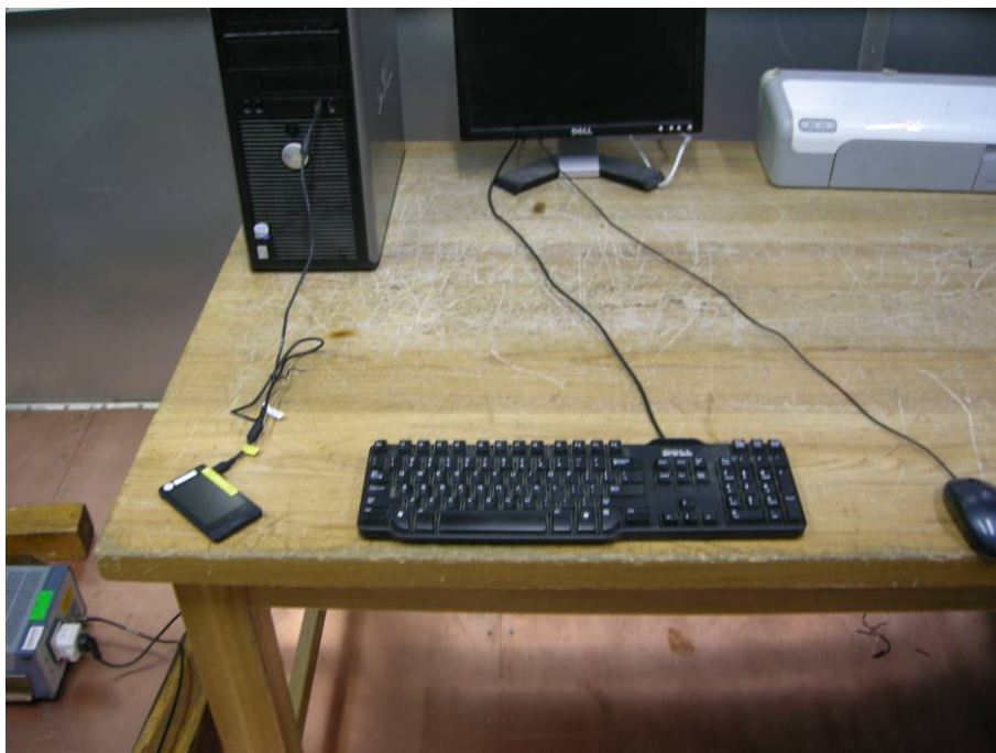
Pic.2 Conducted emission