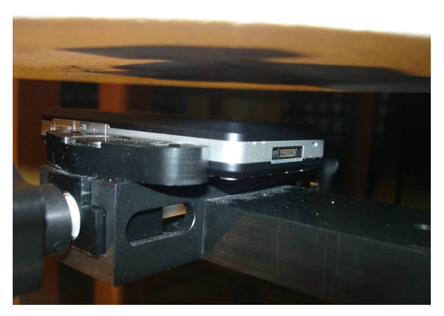
(c) Device on flat section of the phantom. The separation was 15 mm between the device and the flat phantom.