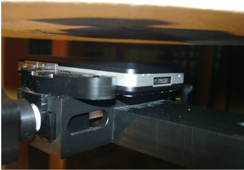
(c) Device on flat section of the phantom. The separation was 15 mm between the device and the flat phantom.