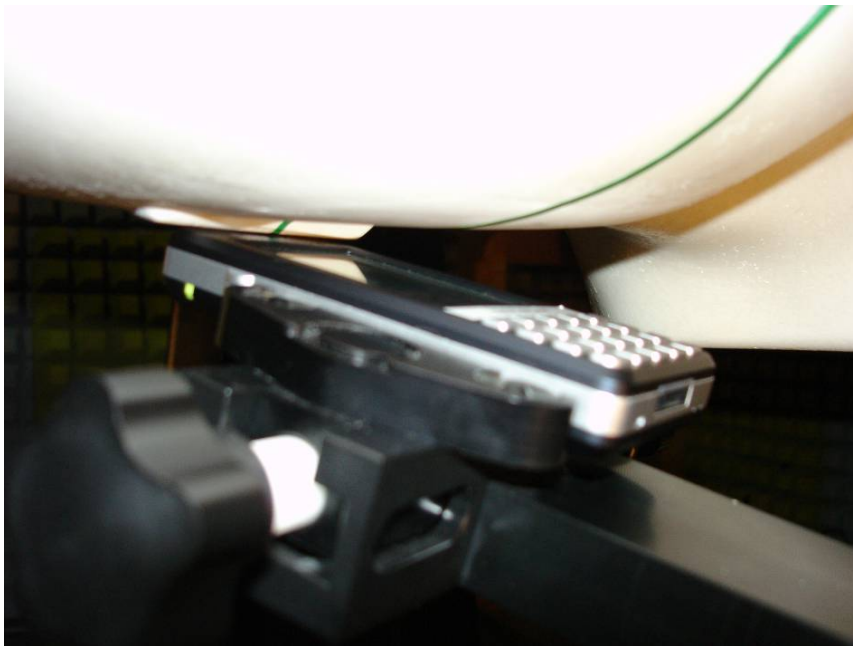
(b) Device on head phantom in the tilt position.