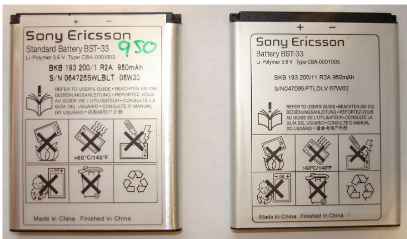
(c) Battery BST-33, type BKB193200/1 (left) and BKB19200/11 (right)