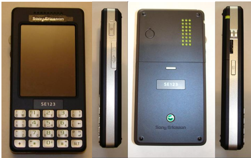
(a) Front, right, back and left view of the PY7F3022016 mobile phone.