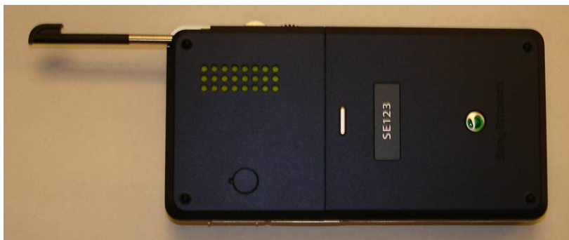
(b) Back of phone with stylus pen partly pulled out.