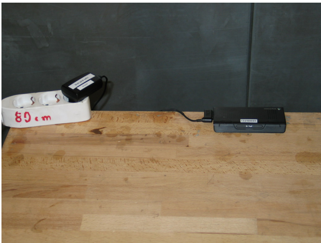
Photo 3: Test setup for conducted measurements (AC Port (power line))