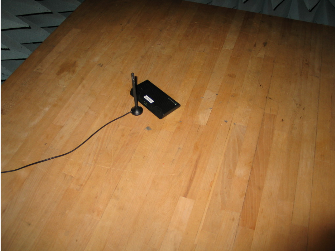
Photo 1: Test setup for radiated measurements (Enclosure, below 1 GHz)