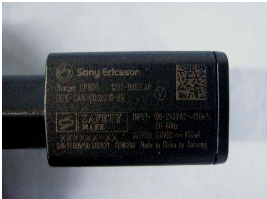
Label of Travel Charger