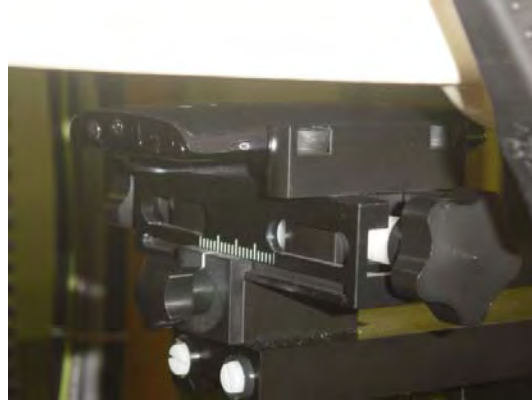
DUT in body position with 15 mm distance