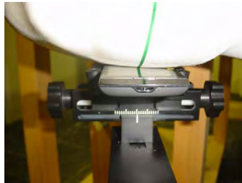
DUT position towards the head: Cheek (touch) position