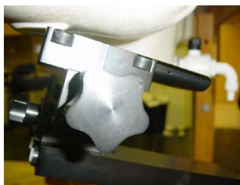
DUT position towards the head: Tilt (touch + 15°) position