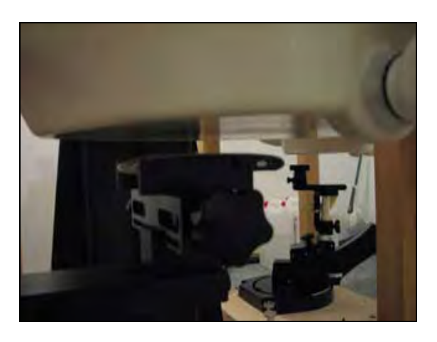
DUT in body position with 15 mm distance