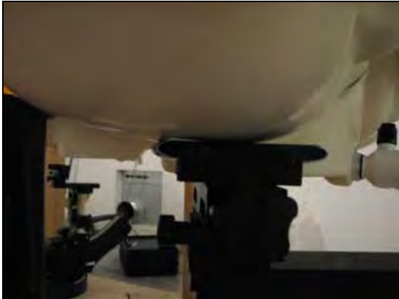
DUT position towards the head: Cheek (touch) position