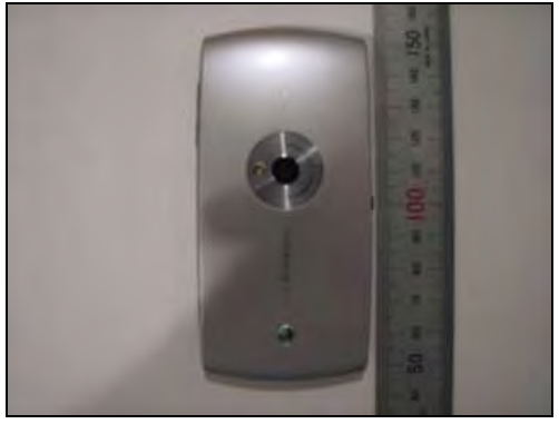
Back side with battery