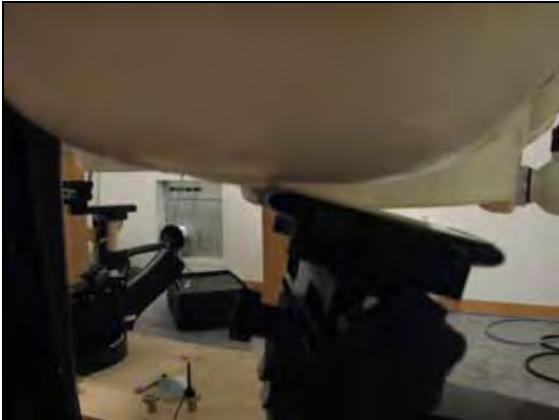
DUT position towards the head: Tilt (touch +15 deg.) position