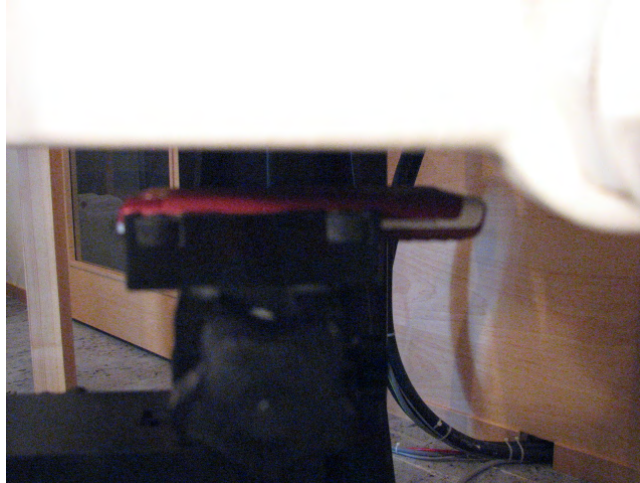
DUT in body position with 15 mm distance