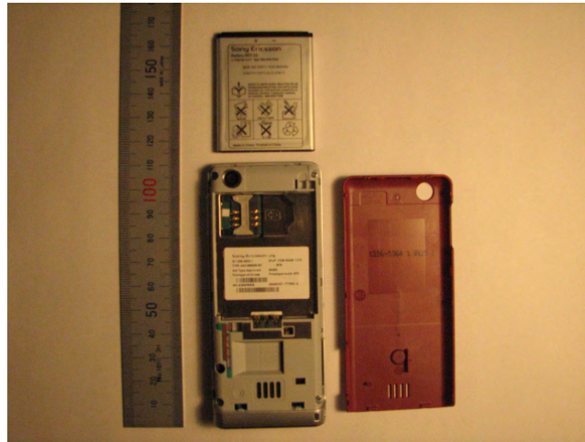
Battery and cover removed