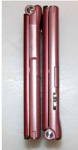
Right- and left-hand side