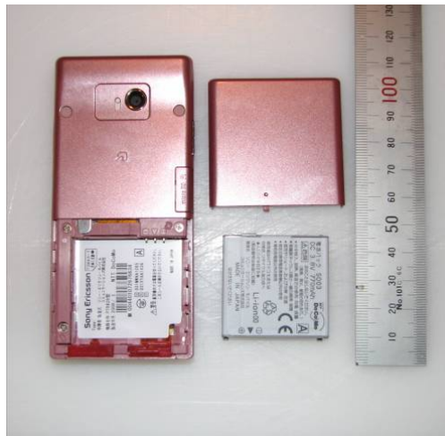
Battery and cover removed