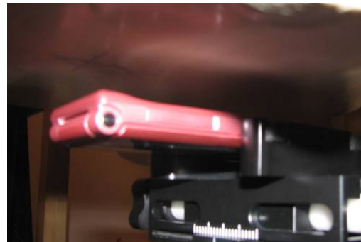
DUT in body position with 15 mm distance