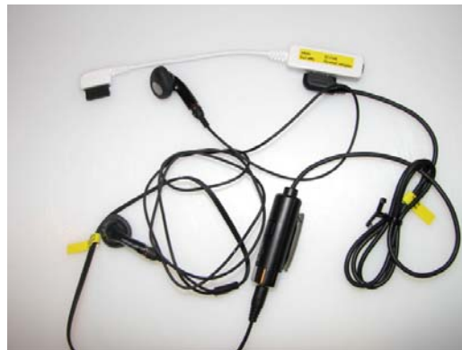
DoCoMo PHF adapter and earpiece