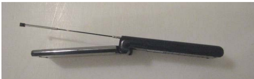
DVB-T Antenna extracted