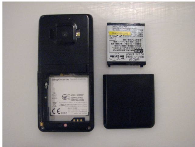
Battery and cover removed