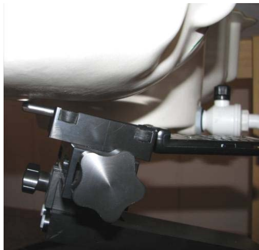
DUT position towards the head: Tilt (touch + 15°) position