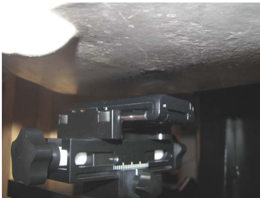
DUT in body position with 15 mm distance