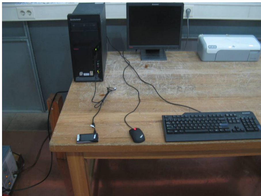
Pic.2 Conducted emission