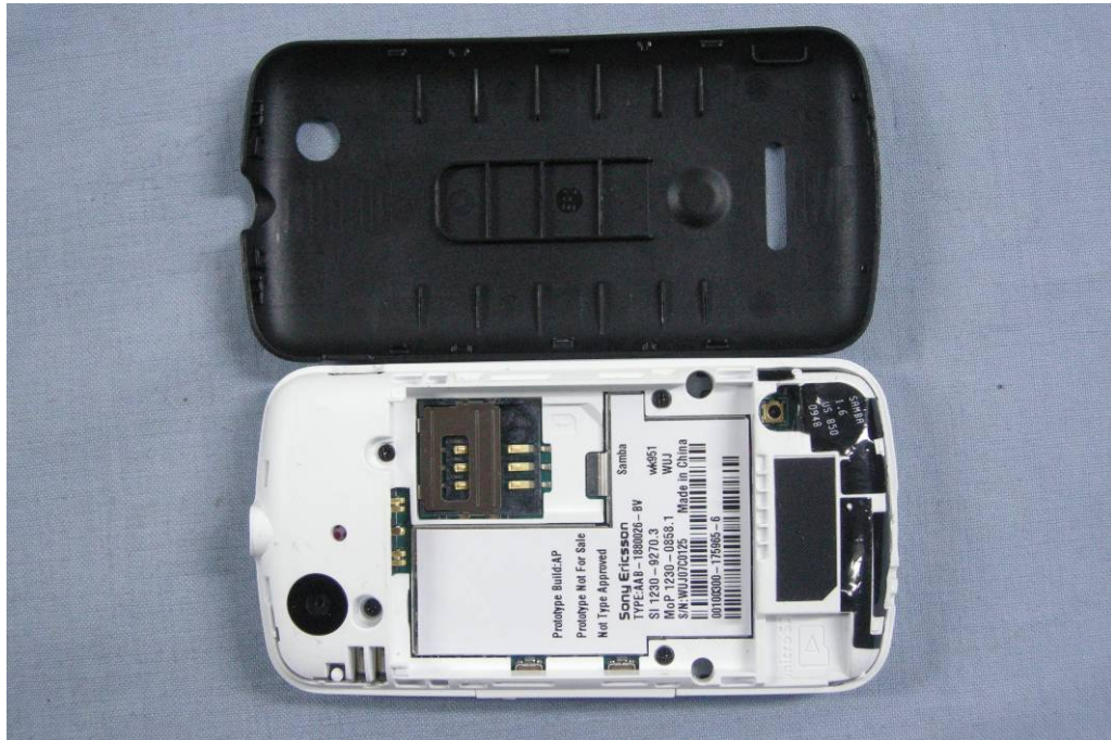
Mobile phone Disassembly