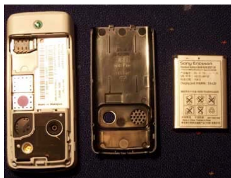
Back with Battery