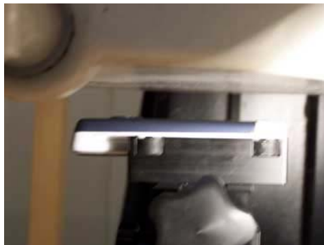
Device position against the body: Phone on 15mm distance against Phantom