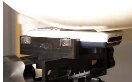
Device position against the head: Cheek (touch) phone position