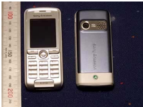
Front & Back side