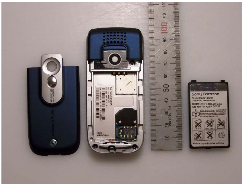
Back side with battery