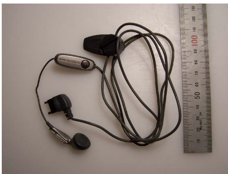
Portable Hand Free HPE-14