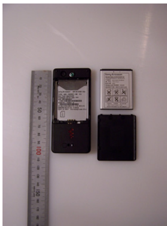
Back side with battery