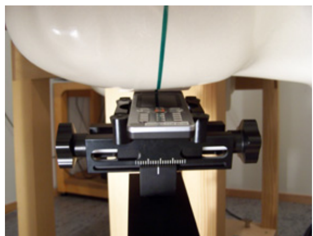
Device position against the head: Tilt (cheek+15deg) phone position