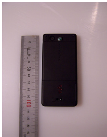
Front & Back sides