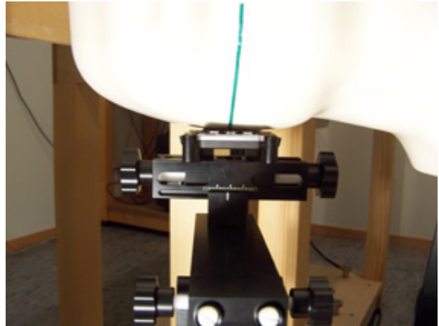
Device position against the head: Cheek (touch) phone position