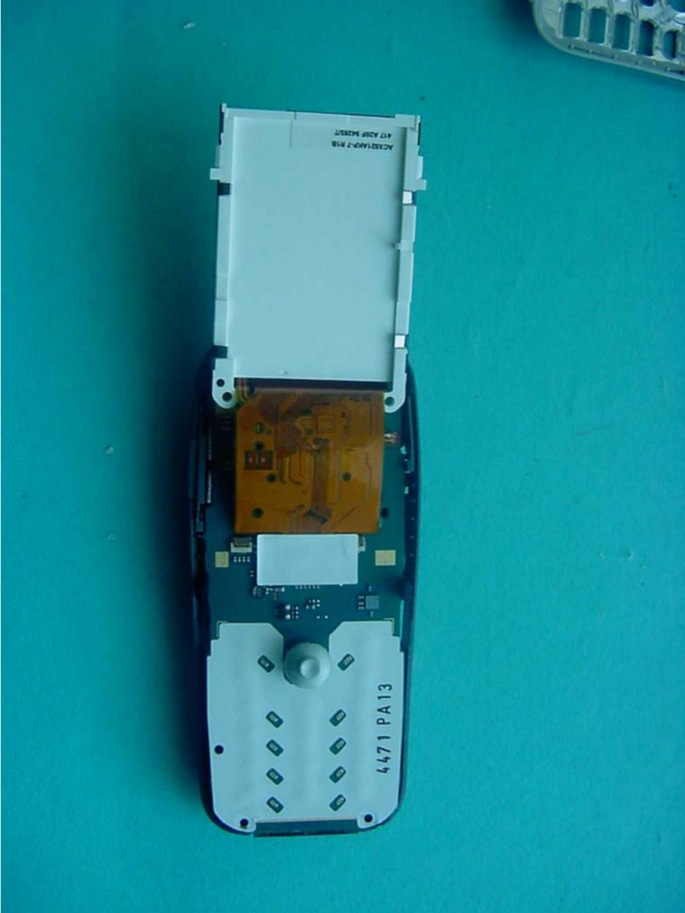
Photograph no.: 7