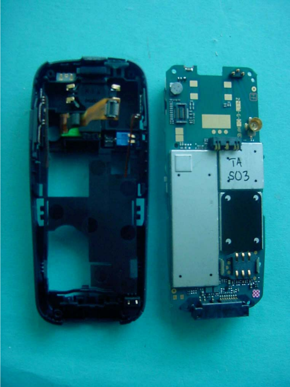
Photograph no.: 8