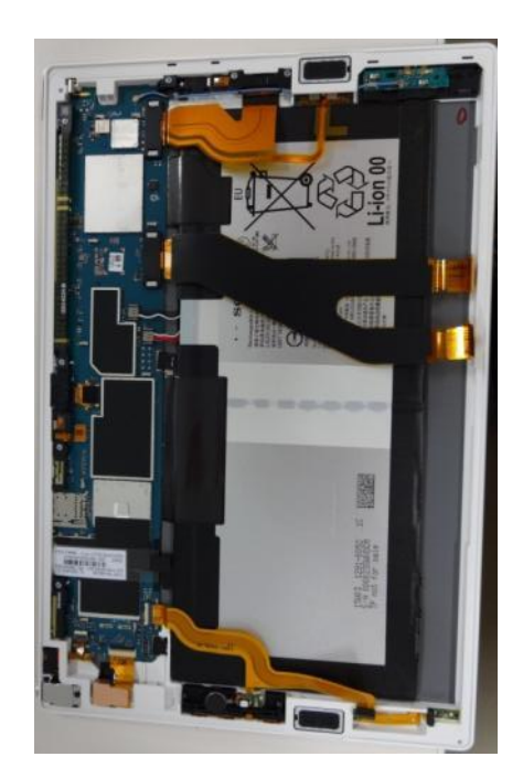
Without Rear Panel