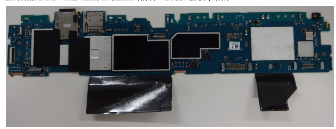
Internal PWB with Shield cases (Front-side)