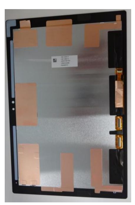
LCD - Rear side