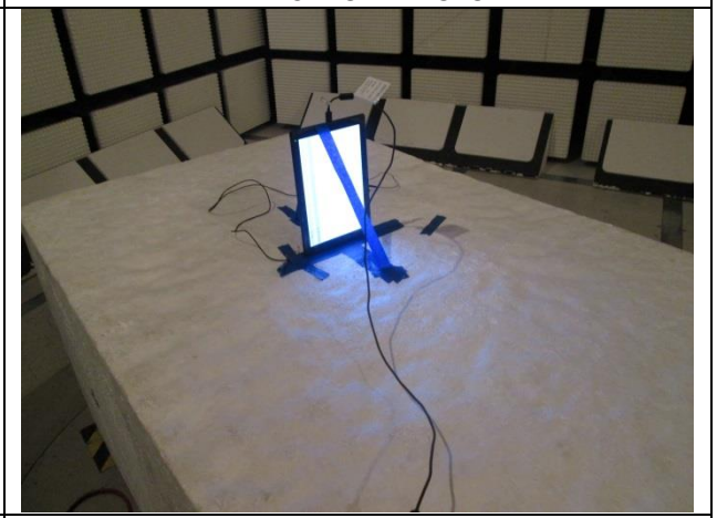
Z-AXIS FRONT PHOTO