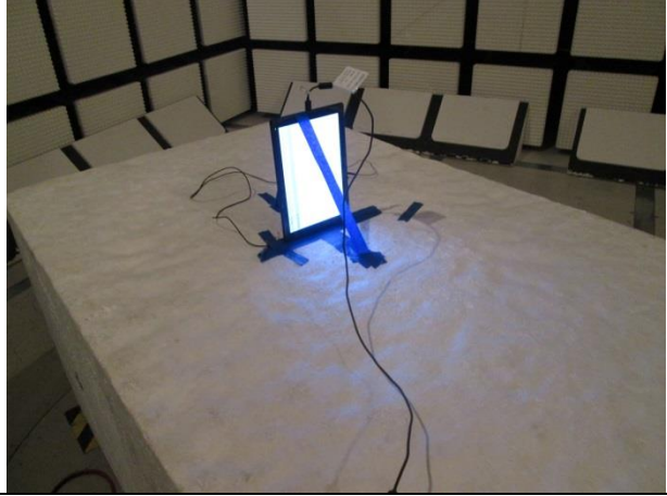
Z-AXIS FRONT PHOTO