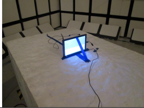
Y-AXIS FRONT PHOTO