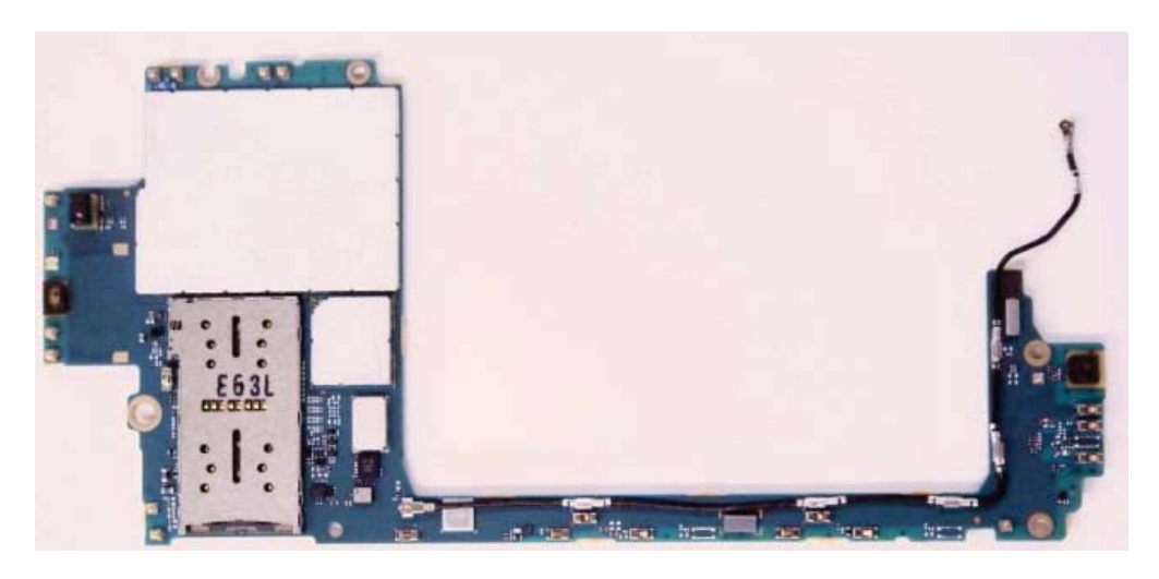
Internal PWB without Shield cases (Rear-side)