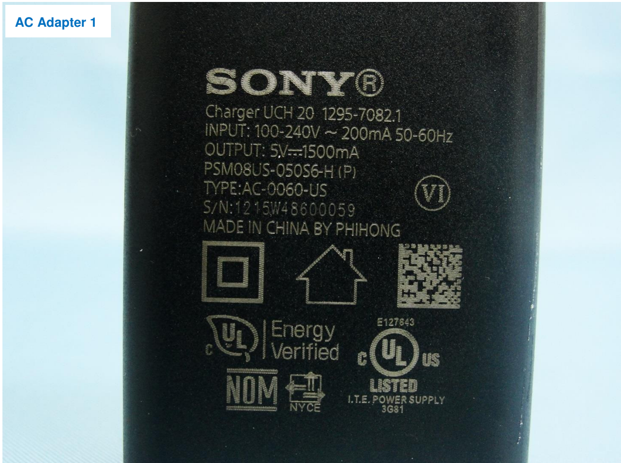
AC Adapter 1