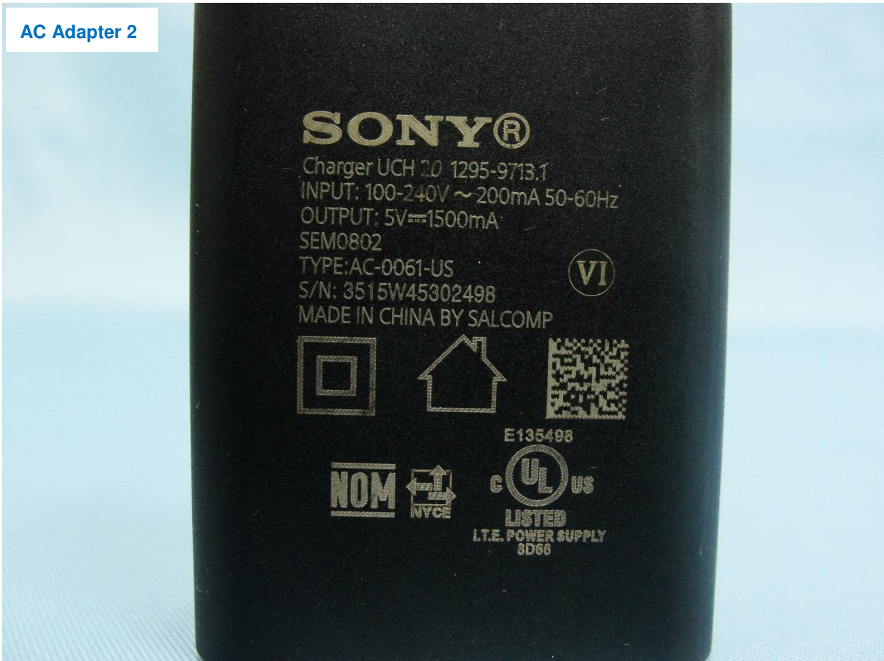
AC Adapter 2