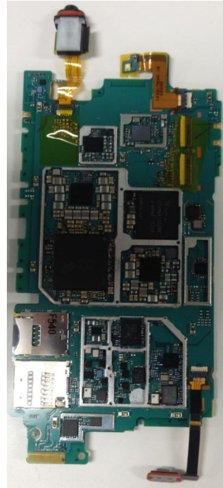
Internal PWB without Shield cases (Front-side)