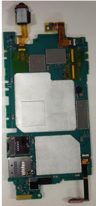
Internal PWB with Shield cases (Front-side)