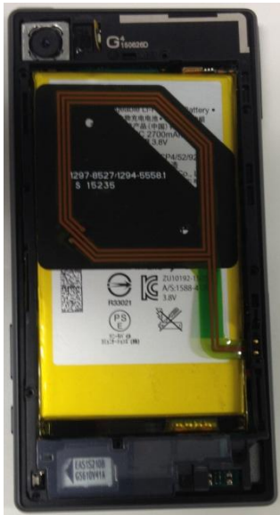
Without Rear Panel