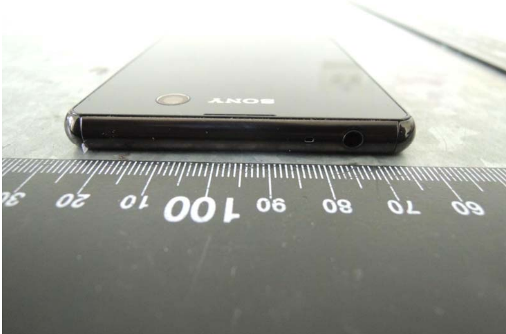
Side View of EUT – 3