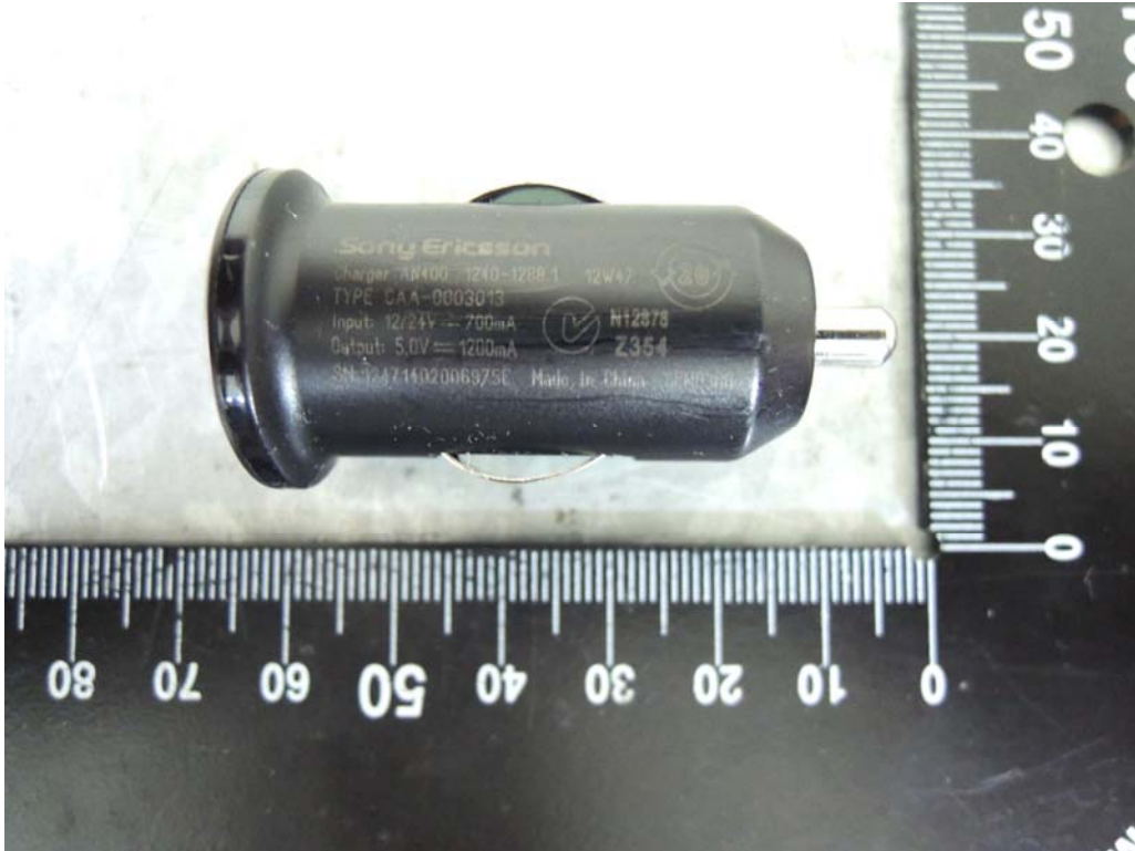
Adapter – 1 (Model No.: EP800, Supplier: Phihong)