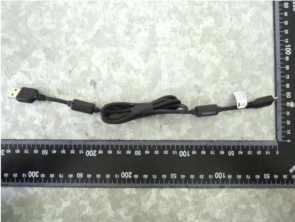
BT PHF - 1