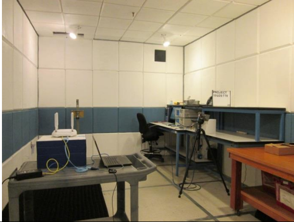
DFS SETUP PHOTO