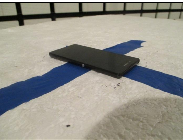
X-AXIS FRONT PHOTO